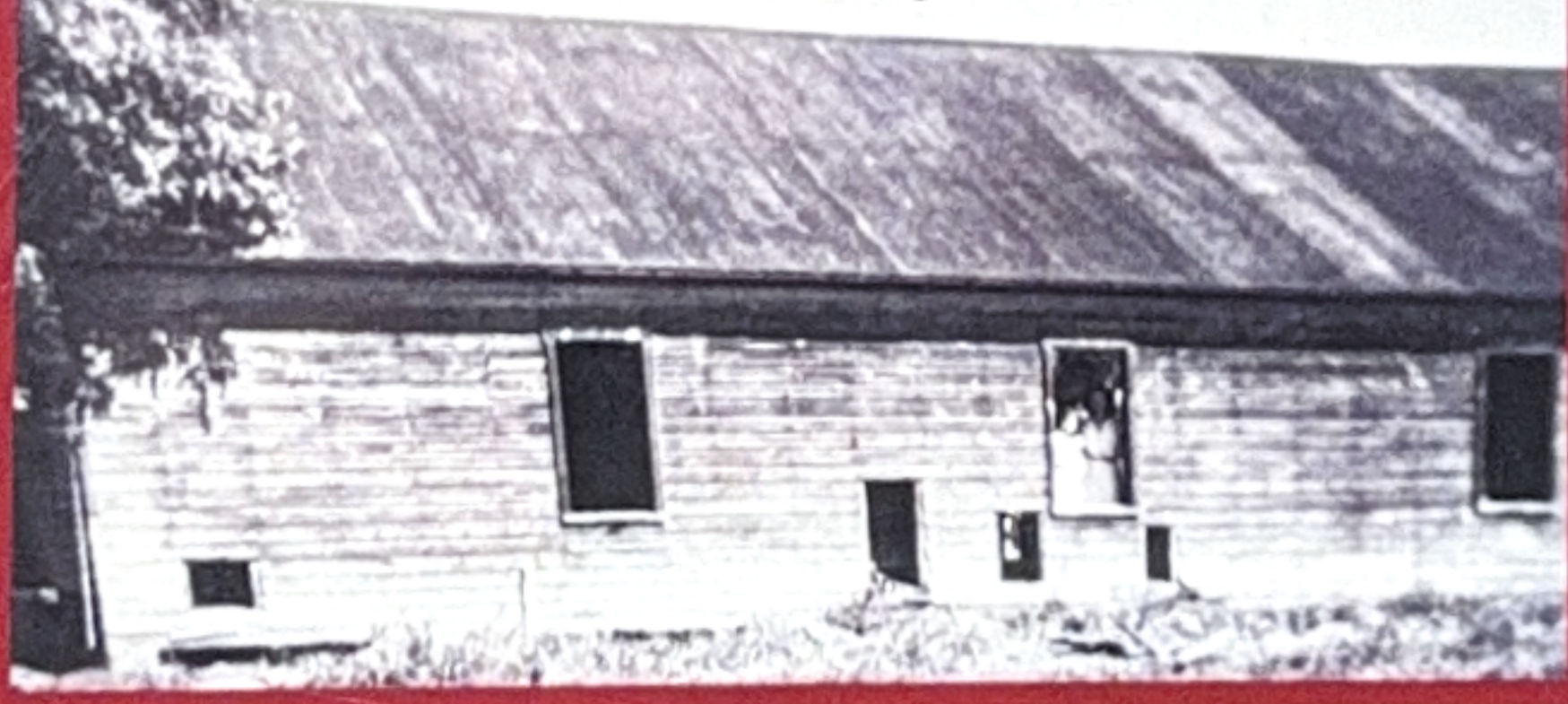
The Original Post 8896 known as the Hog Pen/Chicken House